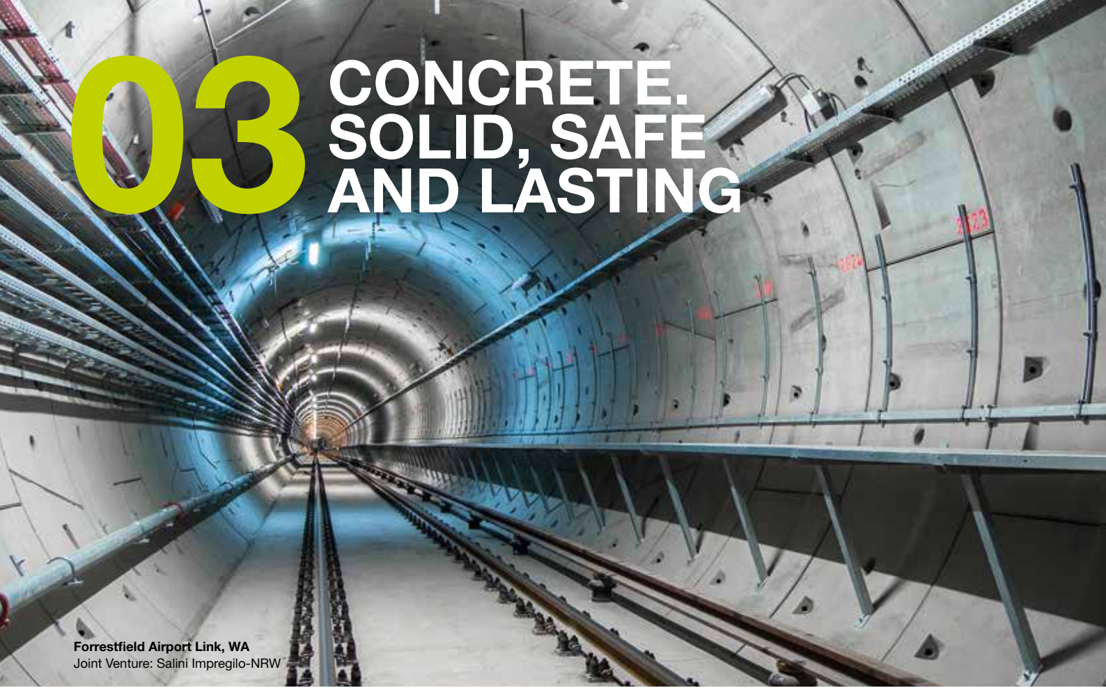
Forrestfield Airport Link, WA Joint Venture: Salini Impregilo-NRW